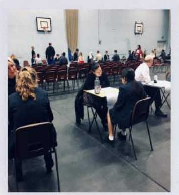
November 2019 Year 11 Mock Interview Day